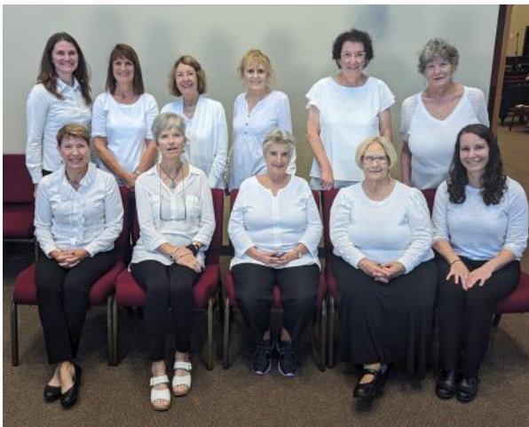
Agape Bell Choir (Left)

Thank you in advance for your help and support for this exciting experience.