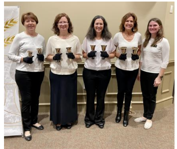
Carillon Bell Choir (right)